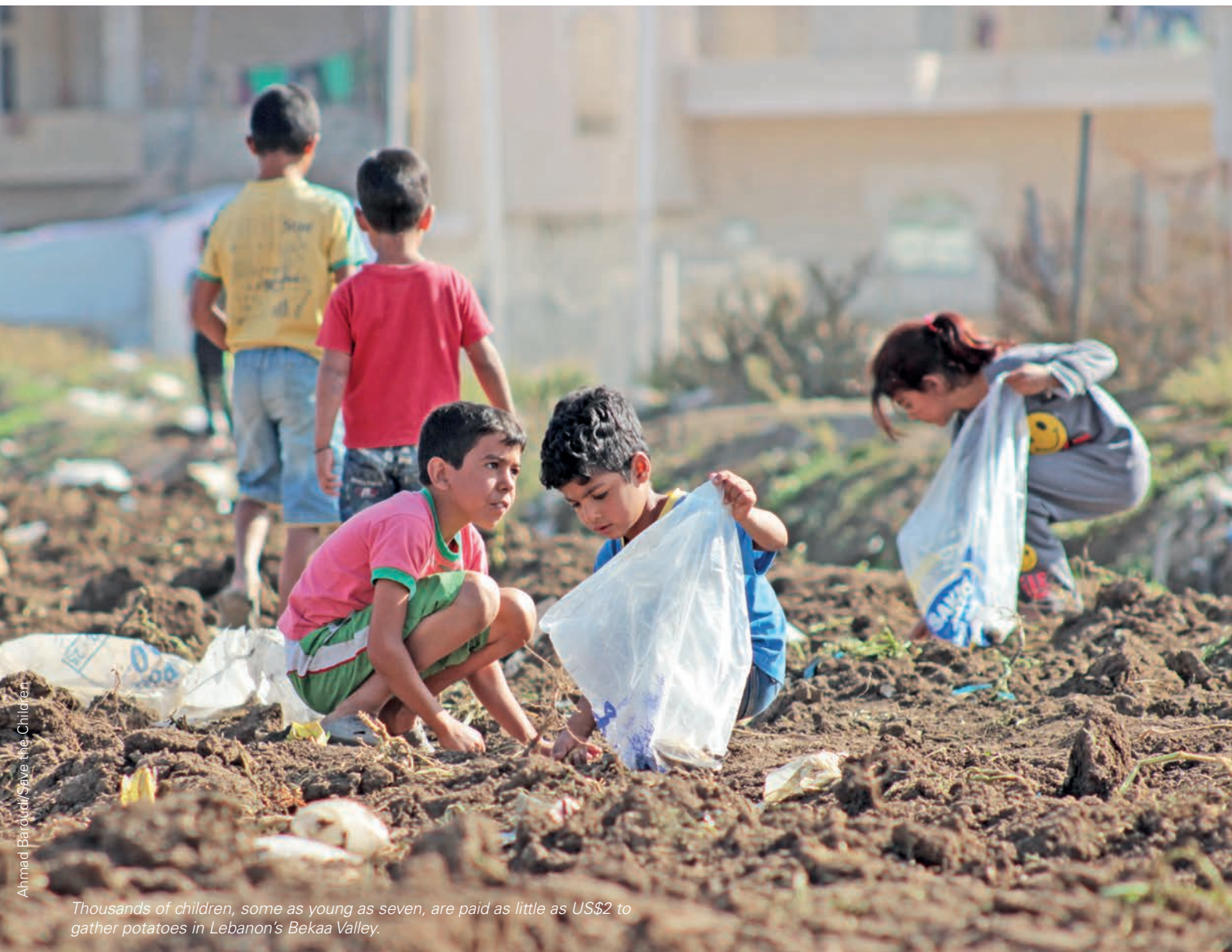
Thousands of children, some as young as seven, are paid as little as US$2 to gather potatoes in Lebanon's Bekaa Valley.

A rapid assessment of child labour in Lebanon found that almost a third of working children were under 14. The report found children of 6, 7 and 8 years old in the north of Lebanon who had been working for at least six months 23 .