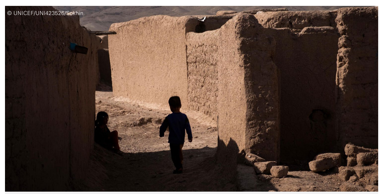
IN 2023, escalations of conflict such as in Sudan and Palestine forced millions to flee their homes. In other regions, earthquakes, storms, floods and wildfires ravaged millions of lives. Often, climate-related stress and conflict are interrelated. In Afghanistan, a child plays among destroyed homes at a camp for internally displaced who have fled the confluence of both conflict and protracted drought.