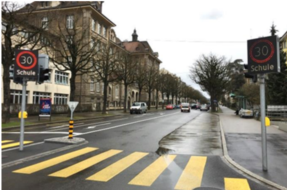
Fig.1: LED variable message panels at the Burgfelderstrasse junction