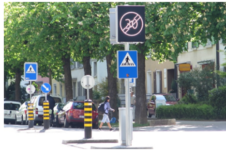
Fig. 3: End of the temporary 30-zone