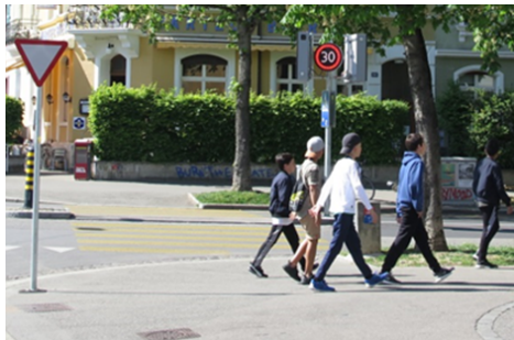
Fig. 2: Hegenheimerstrasse junction